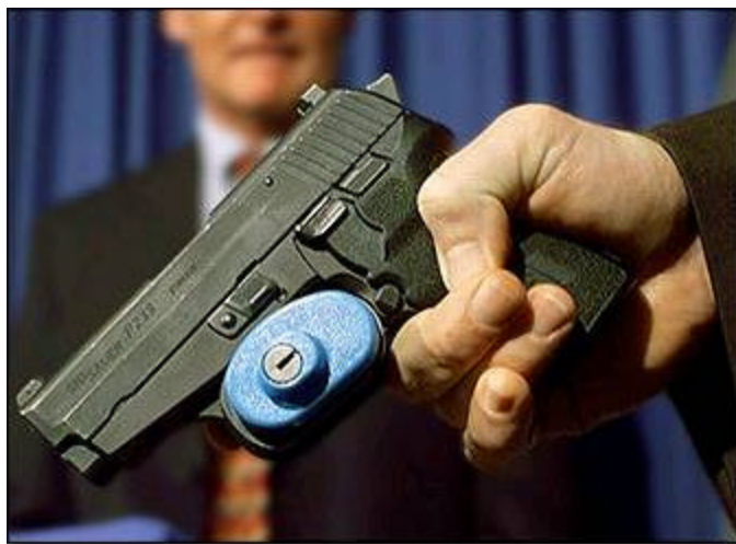
Master Locks Recalled

Master Lock Co. of Milwaukee has voluntarily recalled about 752,000 gun locks, offering free replacements to customers, the U.S. Consumer Product Safety Commission said Monday.